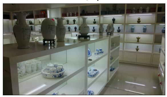
Picture 3: Shop in the Market Section of Hualing Tbilisi Sea Plaza, September 2016

According to insider information, the Sea Plaza was projected to replace or give a new home to Lilo. This idea has failed, as Lilo's administration and marketing people were not ready to relocate, and Lilo continues to function as a trading hub. Hence, as written on Hualing's homepage, the Sea Plaza is intended to "become the largest [...] wholesale, retail and distribution centre [...] [in the] Euro-Asian region."