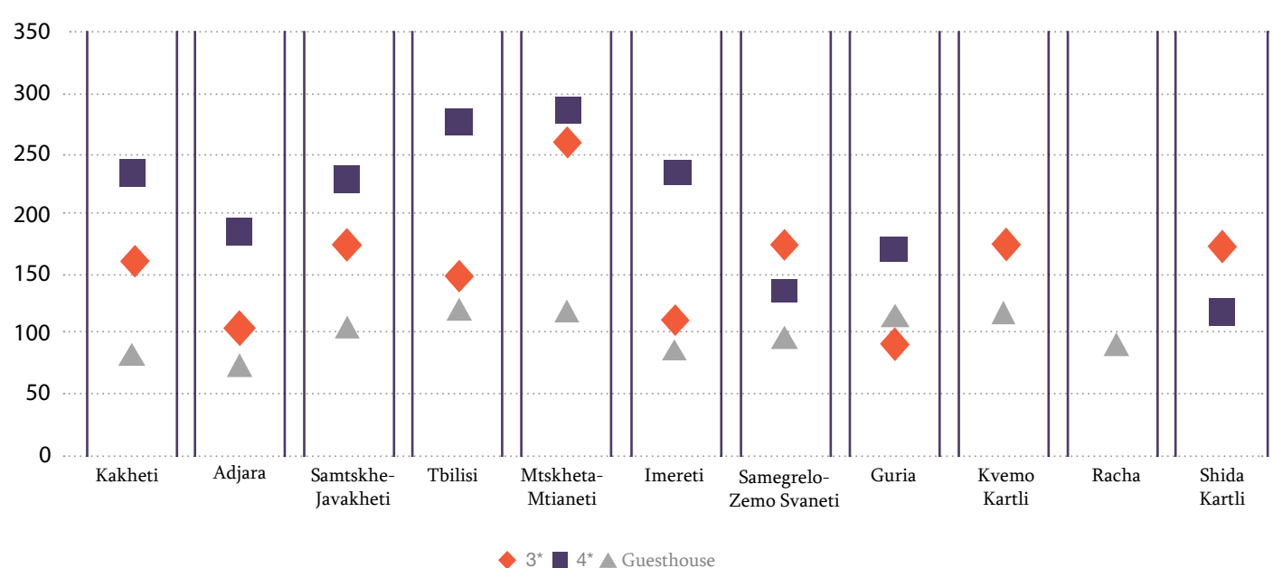
Graph 2 : In the graph, average prices for standard double rooms in 3 and 4-star hotels and guesthouses are given by region. 5-star hotel prices are provided above.

The average prices of 3*, 4* star hotels and guesthouses by regions (October 2021, in GEL)