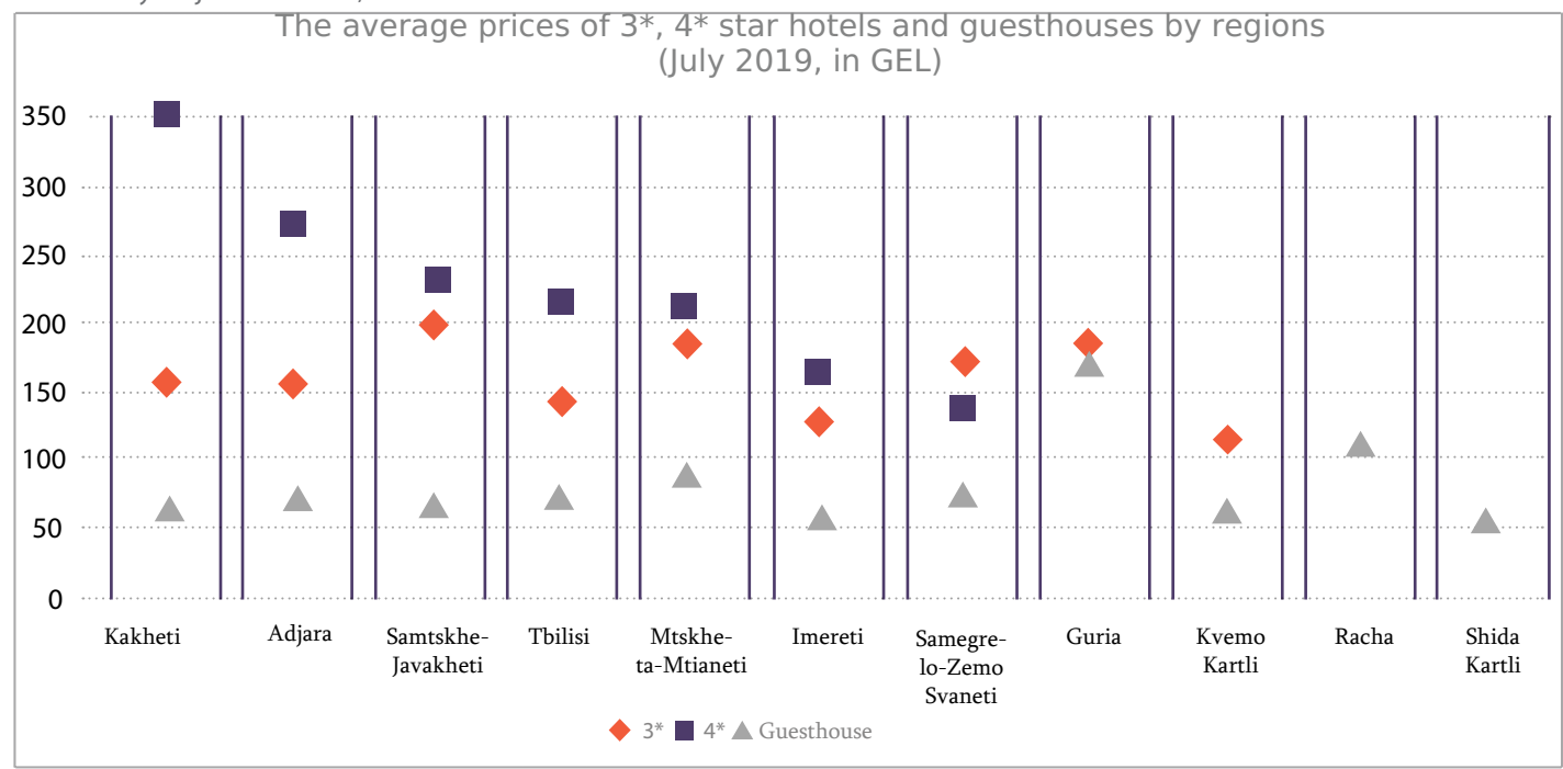
Graph 1: In the graph, average prices for standard double rooms in 3 and 4-star hotels and guesthouses are given by region. 5-star hotel prices are provided above.

The average cost of a room in a 5-star hotel in Georgia in July 2019 was 482 GEL per night. In Tbilisi, the average price was 588 GEL, followed by Adjara – 453 GEL, and Kakheti - 399 GEL and Samstkhe-Javakheti - 380 GEL.