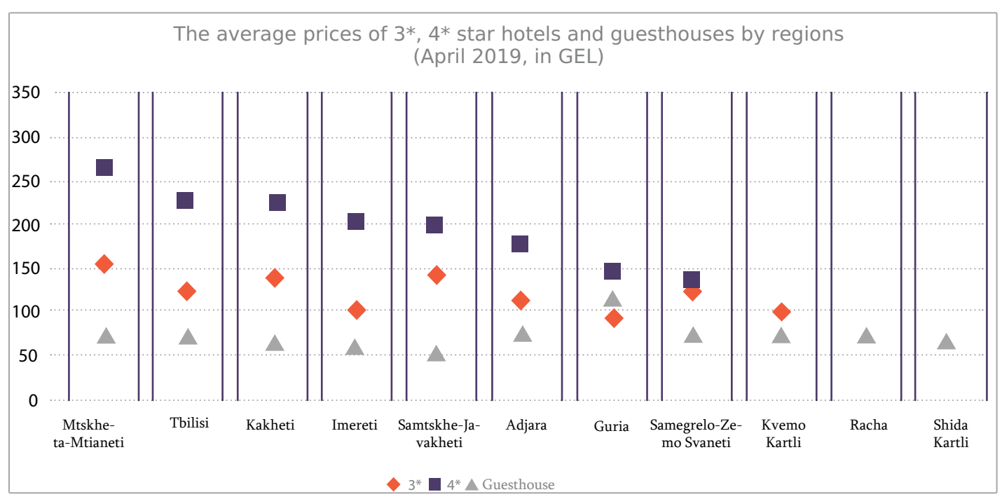
Graph 1: In the graph, average prices for standard double rooms in 3 and 4-star hotels and guesthouses are given by region. 5-star hotel prices are provided above.

The average cost of a room in a 5-star hotel in Georgia in April 2019 was 484 GEL per night. In Tbilisi, the average price was 525 GEL, followed by Adjara – 473 GEL, Samtskhe-Javakheti - 368 GEL, and Kakheti - 367 GEL.